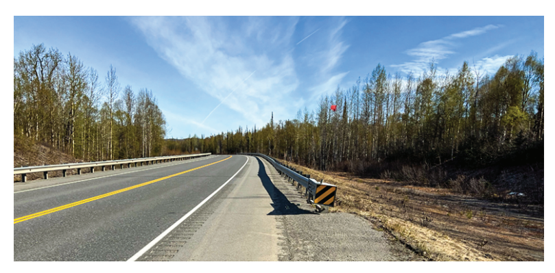
Public Meeting No. 2 | April 11, 2024