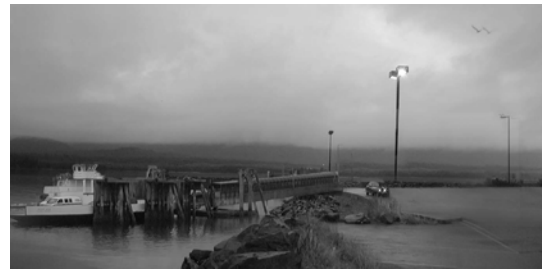
Simulation of Alternative G3 ferry from the north parking area adjacent to Plaza Port West, looking northwest toward Gravina Island

Facilities and Roadway. This alternative would cross Tongass Narrows approximately 1.3 miles south of the airport passenger terminal and would have a crossing distance of approximately 1.3 miles. This alternative would require construction of a new ferry terminal on each side of Tongass Narrows and two new ferry vessels. No dredging would be required to provide adequate navigational depth for the ferry terminal on Revillagigedo Island. The existing breakwater would be incorporated into the design of the ferry terminal parking lot and pier.